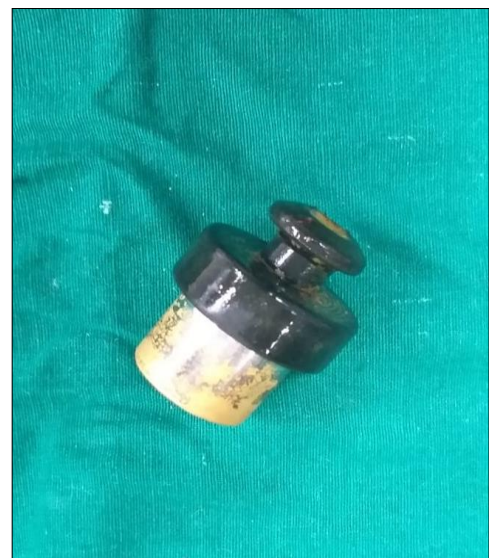
Fig 3: Pressure Cooker Weight