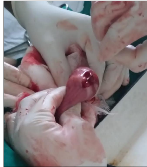
Fig 2: Linear incision made at fundic region