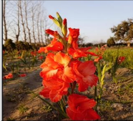
Fig 2: Spike at full bloom stage