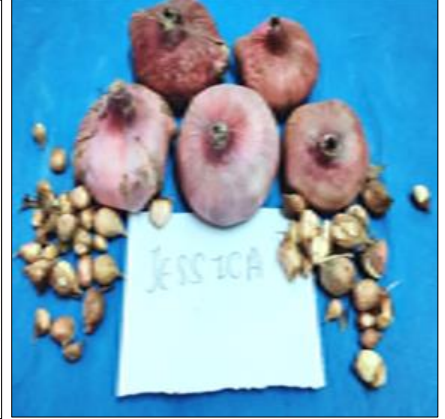
Fig 3: Harvested corms