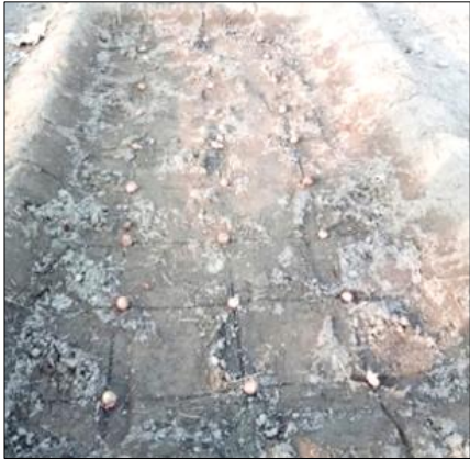
Fig 1: Planting of corms

(Chandrappa et al. , 2006) [10]. Compounds such as hexanoic acid, phenols, etc. known for their antimicrobial properties may also contribute to this effect (Revathi et al. , 2023) [18]. These findings align with Bhalla et al. (2006) [7], who found that a mixture of manchurian mushroom tea and panchagavya increased vase life in Gladiolus cv. Red Beauty. Presence of GA 3 in fermented fertilizers increased leaf number and photosynthetic area, enhancing photosynthetic assimilates in sinks through increased cell division, expansion, and intercellular volume of mesocarpic cells (Baskaran et al. , 2014) [5].