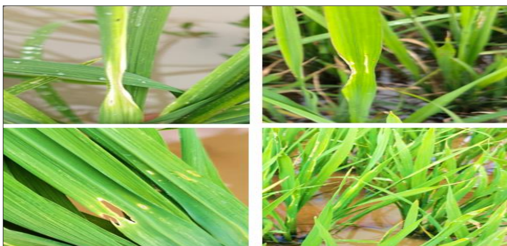
Fig 3: Damage symptoms caused by the whorl maggot in the rice crop