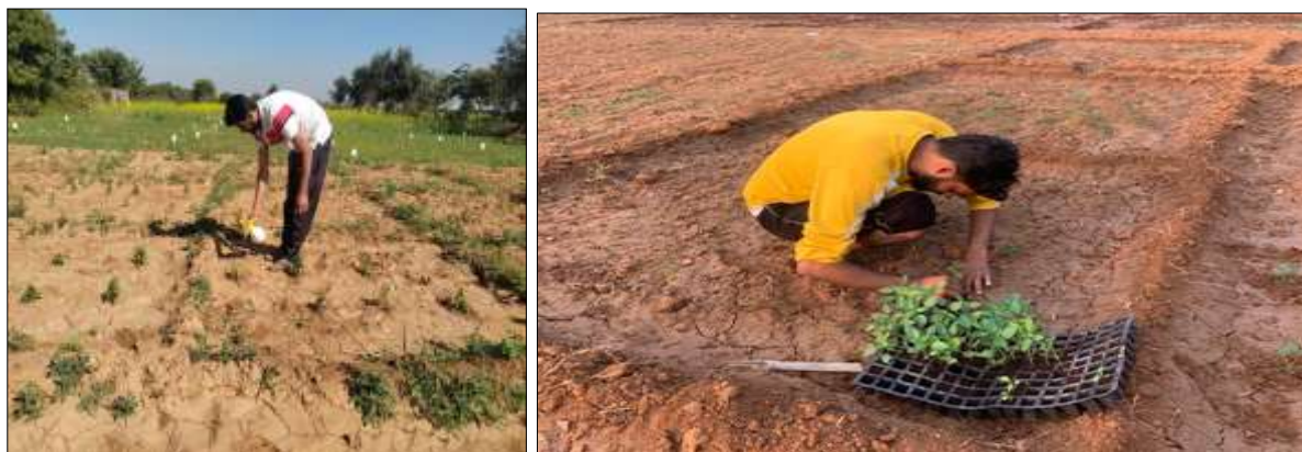
Fig 2: Seedling transplanting and field preparation