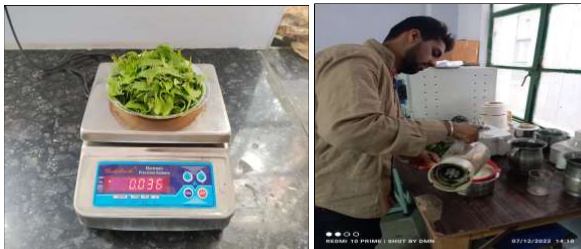
Fig3: Extract preparation