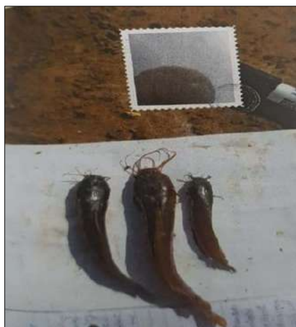
Appendix IV: Clarias camerunensis