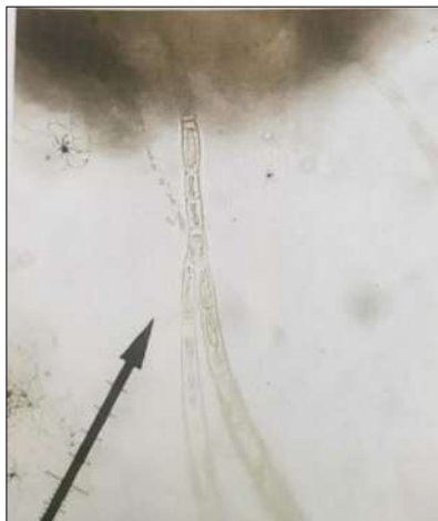
Appendix II: Microcystis sp.