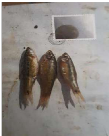
Appendix VIII: Schilbe mystus