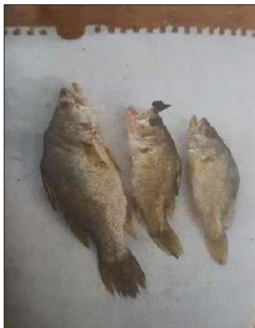
Appendix IX: Lates niloticus