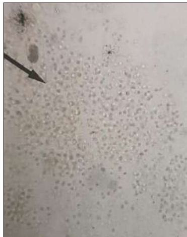
Appendix I: Cladophora sp.