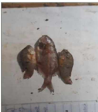
Appendix VII: Hemichromis guttatus