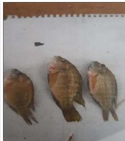
Appendix X: Oreochromis niloticus