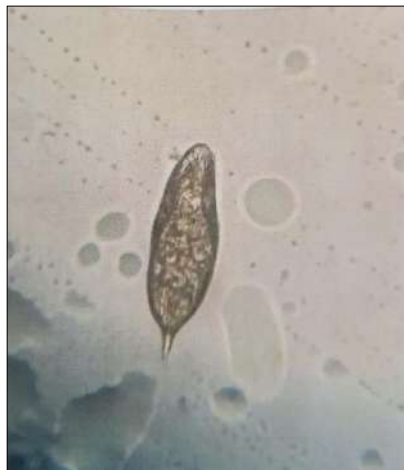
Appendix III: Euglena sp.