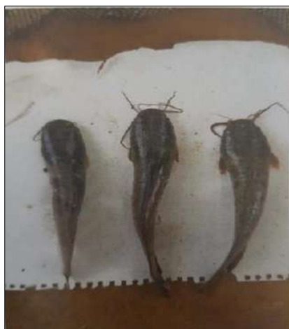
Appendix VI: Clarias anguillaris