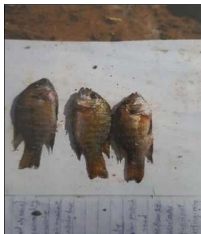
Appendix V: Hemichromis niloticus